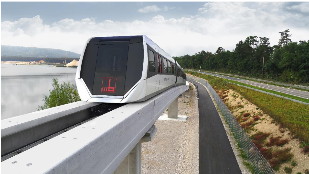
TSB on test track in Sengenthal, Germany.