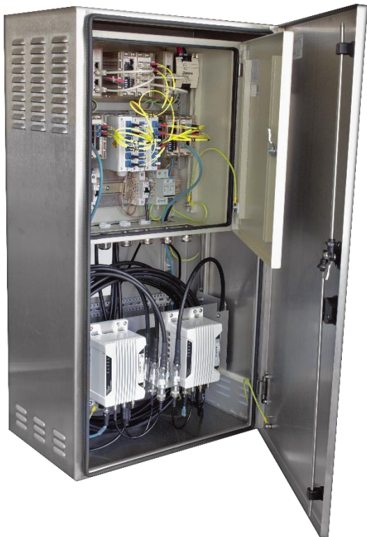
Westermo's specially developed Trackside-Radio-Equipment-Box (TRE-box)

A key part of the network solution was a specially developed trackside radio equipment box (TRE-Box) containing the WLAN access points, RedFox Ethernet switches and fibre terminators. The Westermo TRE-boxes form the basis of the redundant ring network, with FRNT subrings connecting each TRE-box. The prefabricated TRE-Boxes are fully equipped, tested and configured, helping to simplify commissioning and reducing time and cost for installation.